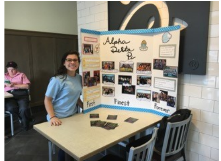
You only need a poster or handouts, but having both is better