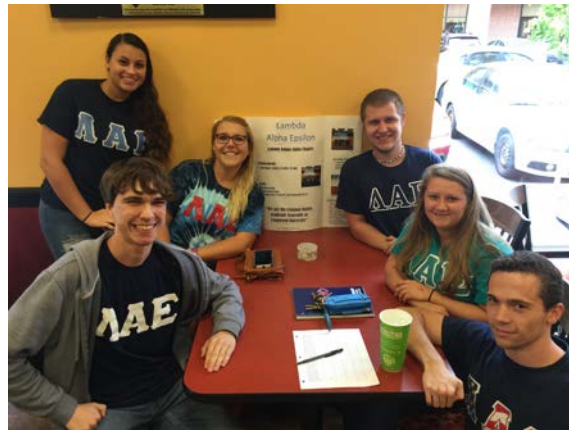
Poster (required), sign up sheet and all wearing their letters (additional)