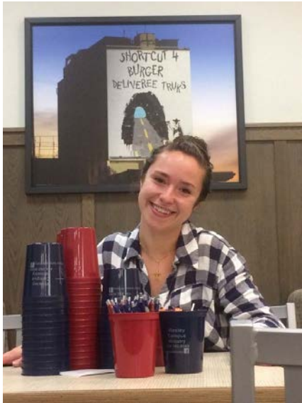
Wesley Campus Ministry brought flyers, cups and pens to give out.